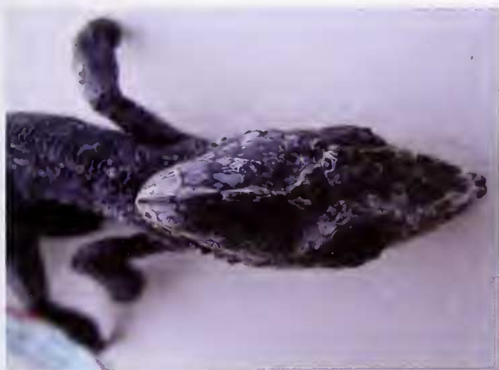
Fig. 5. Head view of the holotype of K. u. artytor ssp. n..

noon. In spring and autumn the cages were sprinkled with water four times per day (in midsummer 6 times) for up to four minutes in the hottest time of the day. During the winter the terrariums were illuminated with common terrarium-tubes (T5 with 35 W) 13 hours per day. A halogen spot was activated for 45 minutes three times per day for basking, so that the ambient temperature stayed between 22 and 24 °C at day time and between 6 and 16 °C at night time. The terrariums were completely sprinkled with water in the morning and evening. The diet consisted of small arthropods, mainly self-bred crickets, grasshoppers, flies, cockroaches etc. Every second feeding the food was enriched with vitamins and minerals. Only pregnant females were additionally given small pieces of cuttlebone. To trigger mating behaviour, the males were transferred into the cages of the females. Immediately, the males started head bobbing and displayed bright colours.